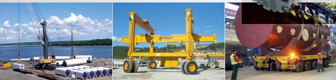
A few of our reference customers: